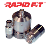
RAPID FIT™ Connectors

Radio Frequency Systems' line of high performance coaxial cable connectors are designed specifically to provide the highest quality connector-cable interface while simplifying and speeding up the attachment of connectors to CELLFLEX® coaxial cables. RFS connectors are fully tested for mechanical and electrical compliance specifications. They are available in all popular cable sizes in a variety of mating interfaces. To join two cables with EIA connectors, two identical socket connectors are installed on either end of the cables to be joined, and a coupling element is used to make the connection of the center conductor. The coupling element must be ordered separately with the exception of the S-Line male versions that have a captivated coupling element. Connectors are available in sizes matching the nominal cable size. EIA connectors provide optimal power handling for the complete transmission line system.