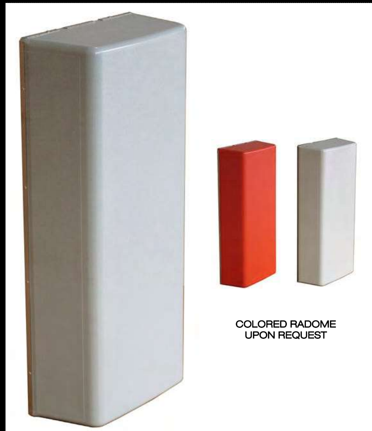
COLORED RADOME UPON REQUEST

4 dipoles panel. Directional radiation pattern. Suitable for stacked or 90° couplings arrays. Pressurizable. Broadband 470 ÷ 862 MHz.