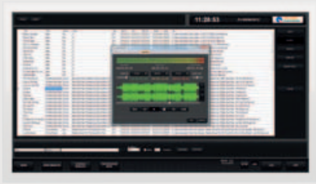
AUDIO RECORDING/IMPORT & EDITING