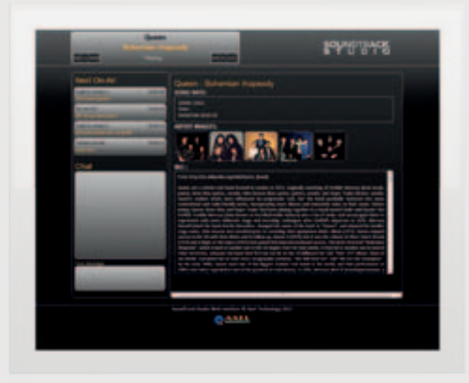
ON AIR WEB VIEWER

Soundtrack can also import commercial scheduling from RAM-COMM , which is specially design for network, syndication and any other application that need advanced commercial management.