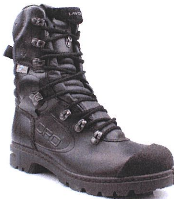
FENIX BLACK 2.1

Group 513 Category: S3 AN CI WR HRO SRA; F2A HI3 Manufactured in month and year marked on the footwear