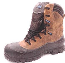
EXPLORATION HIGH BROWN