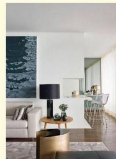
TOP RIGHT The sofa is dressed up on either side with simple Carl Hansen wood tables, which are decorated with vintage ceramic vases and iconic lamps. The living room is linked at one end to the kitchen, which gives the apartment an integrated feel.

Space, light and modernity exude from every aspect of this home to emphasise the apartment's bright and breezy feel. To play up the interior space, Cristina replaced an original wall between the entrance and living areas with sleek and contemporary slim rotating panels that can be adjusted to vary the amount of light entering the space.