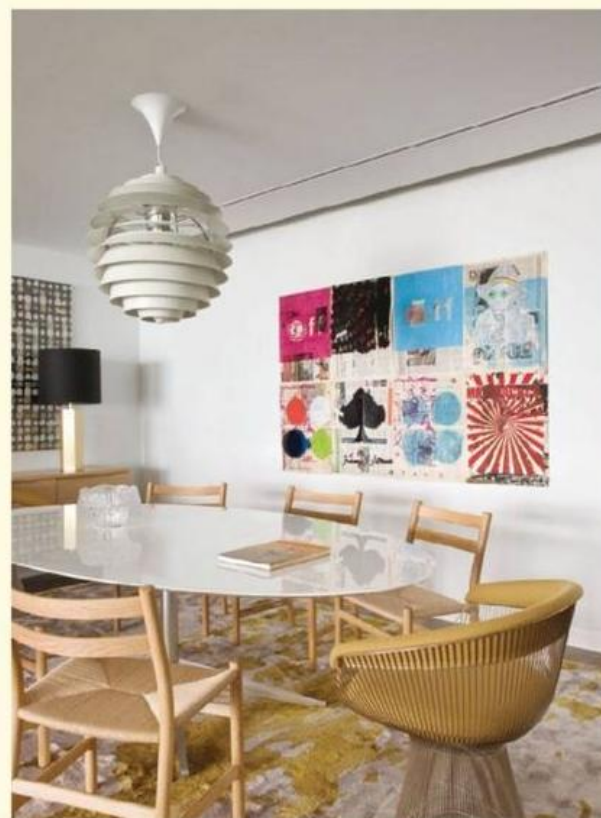
ABOVE The crisp Florence Knoll dining table is surrounded by a medley of Hans Wegner wood and straw chairs and Warren Platner armchairs for a casual, comfortable feel. A Louis Poulsen Louvre lamp above adds a touch of retro chic.