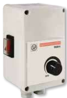
LxWxH (mm): 83 x 81 x 160