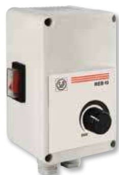
LxWxH (mm): 115 x 95 x 195