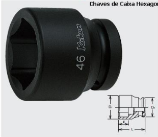
Chaves de Caixa Hexagonais