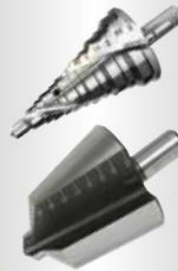
Multi-Step Drills Conical One-Lip Bits