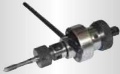
Accessories - Tapping Attachments/Drill Bits