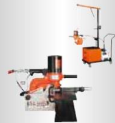
Accessories - Service-Boy/APS Go