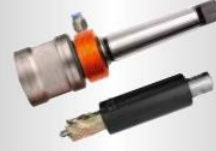
Accessories - Arbors