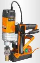
Metal Core Drilling Machines