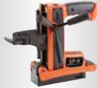
Magnetic Drill Stand