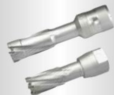
Core Drills - TCT suitable for FEIN + Hitachi