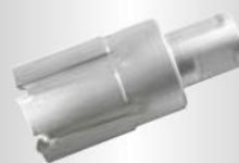
Core Drills Rail TCT