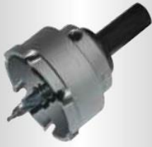
TCT-Hole Saws MBS-Light