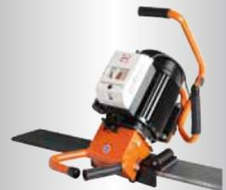
Bevel Milling Machine SKF 63-15