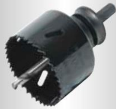
Hole Saws HSS-Bi-Metal/Sets