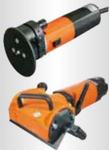
Edge deburring Units