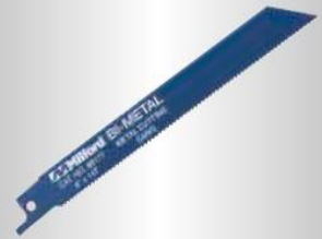
Milford Sabre Saw Blades