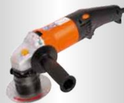
Edge Deburring Unit KFK 5