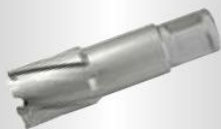
Core Drills TCT Weldon