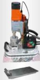
Vacuum Plate RB 50 X Vacubest