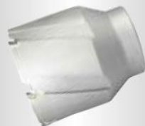
Core Drills TCT