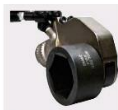
RSL4 + RSL4i/60 RSL4 + RSL4i/60