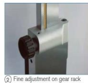
② Fine adjustment on gear rack